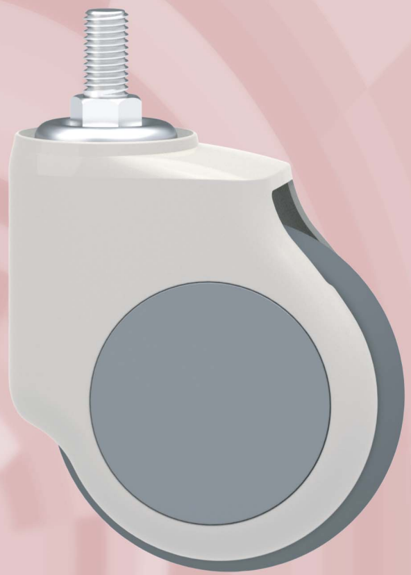
TPRJ-125-C ø125mm (5") Wheel

100 kg maximum load capacity, as tested according to BS EN 12530:1999 Castors and wheels for manually propelled institutional applications requirements